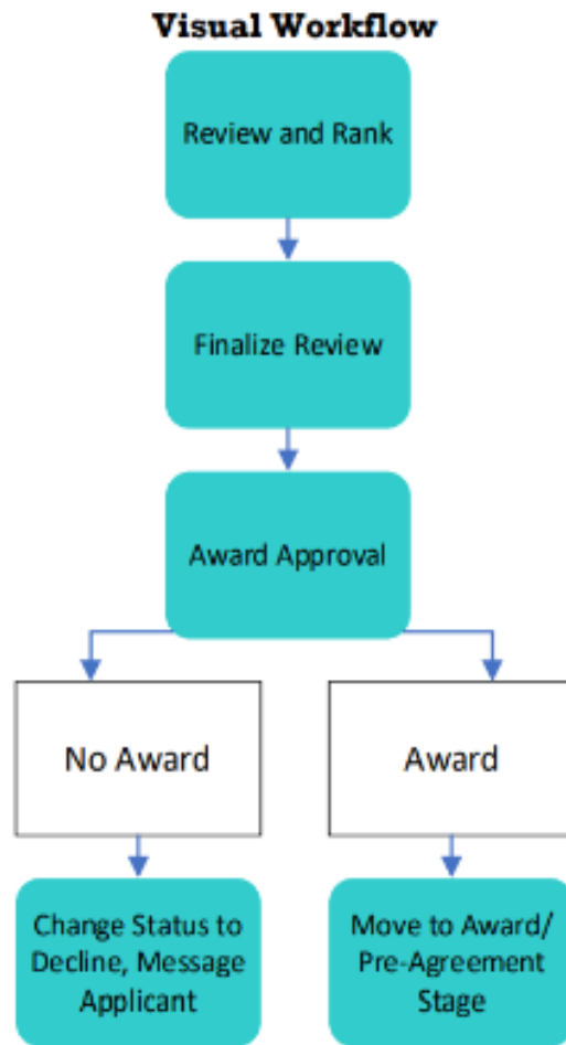
740 741 Figure 3: Flowchart of review and ranking workflow for WMCC staff