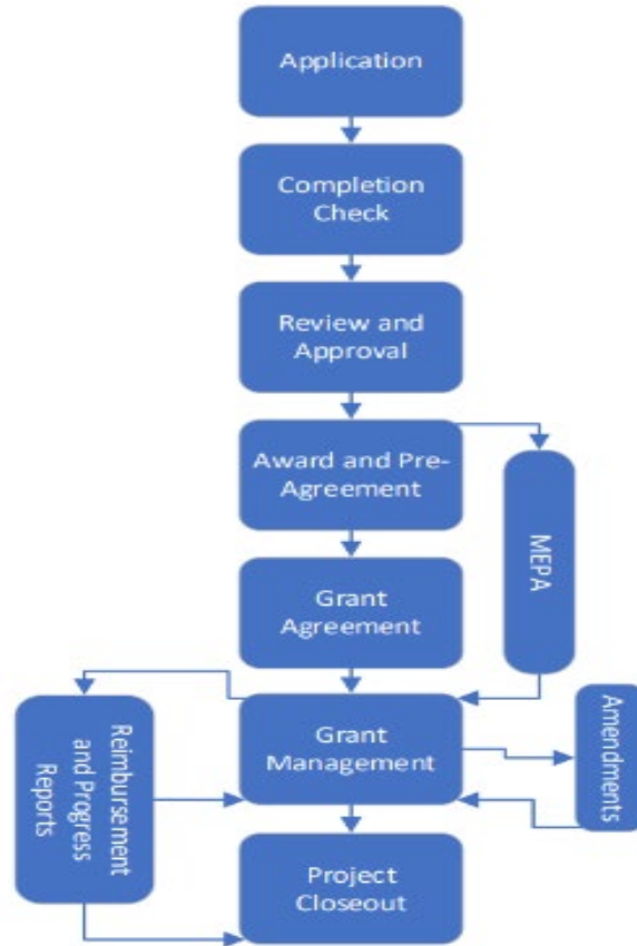
698 699 Figure 2: Flowchart of grant management workflow